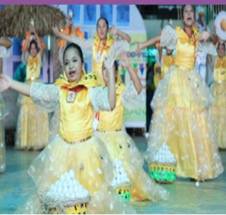
Sinuam Festival also serves as the foundation day anniversary of San Jose.

It is believed that the first inhabitants in the land currently occupied by the municipality of San Jose were the Aetas. They were displaced by new groups of settlers who named the area "Malaking Tubig". After the eruption of Taal Volcano in 1754, Malaking Tubig was separated from Bauan and was established as the town of San Jose de Malaquing Tubig in April 26,