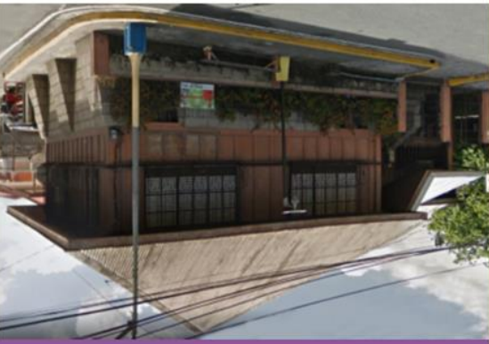
Ona Ancestral House along Makalintal Ave., Poblacion, San Jose, Batangas

The Ona family was one of the well-known families in San Jose. This ancestral house is one of the old houses that can be found along Makalintal Avenue. Other ancestral houses are also located around the Poblacion area.