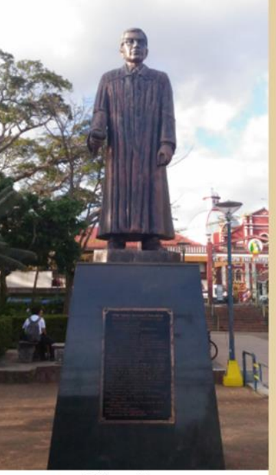
Statue of former Chief Justice Querube C. Makalintal located at the town plaza