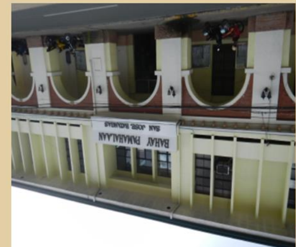
Old Municipal Hall Building in Poblacion IV, San Jose, Batangas

The old municipal hall was built along Makalintal Ave. in Poblacion IV, and it has been the center of government in the municipality of San Jose for years before finally relocating it in Don Luis, San Jose, Batangas.