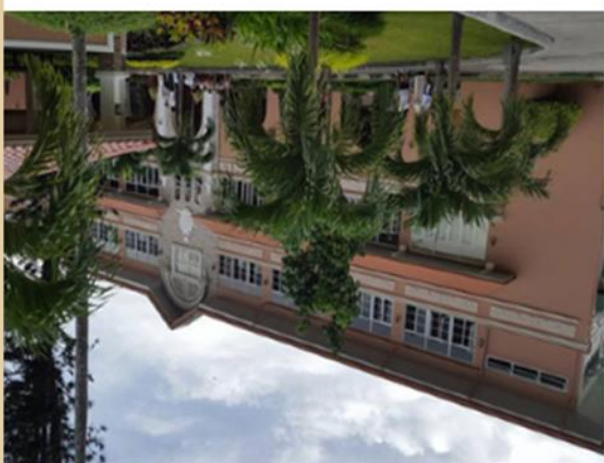
Oblates of St. Joseph Minor Seminary, Brgy. Poblacion I

The Oblates of St. Joseph (OSJ) is a congregation of men founded by St. Joseph Marelllo in 1878. The Oblates aim to serve the interests of Jesus by answering to the needs of the poor, disabled, and uneducated. They first arrived in 1915 at San Jose Malaquing Tubig (now known as part of the Municipality of San Jose).