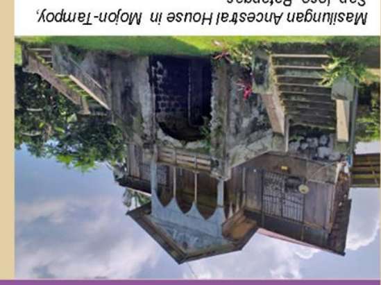
Masilungan Ancestral House in Major-Tampoy San Jose, Batangas

Also known as "Kamaling", this ancestral house is owned by the Masilungan family, one of the well-known families in San Jose. The house's architecture is similar to other ancestral houses found in other towns in Batangas.