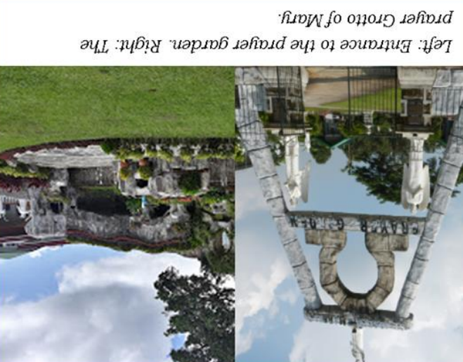
Left: Entrance to the prayer garden. Right: The prayer Grotto of Mary.

The prayer garden consists of various statues that shows the Stations of the Cross, the Seven Joys an Sorrows of St. Joseph, the OSJ Ossuary, a prayer Grotto, and statues of various saints. The devotion to the Seven Sorrows of St. Joseph started during the 1500s. The Seven Joys of St. Joseph Marelllo Prayer Garden is located behind the St. Joseph Parish.