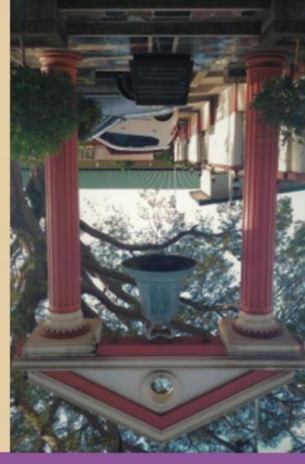
Belfry at the St. Joseph Parish patio