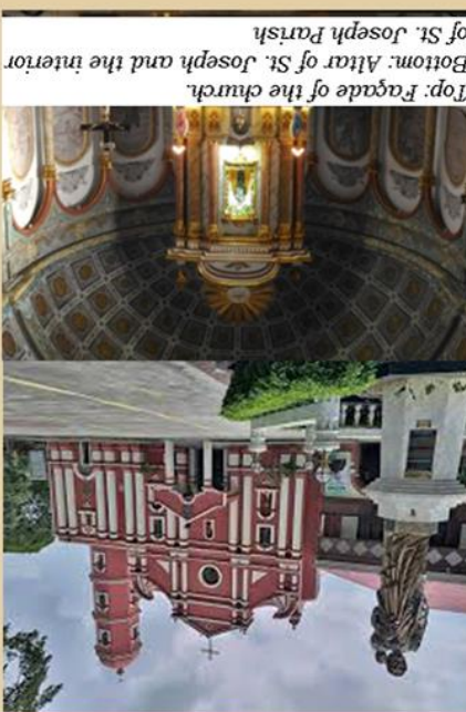
Top: Façade of the church and the interior of St. Joseph Parish Bottom: Altar of St. Joseph and the interior

The parish of St. Joseph was established by Augustinian friars in 1765. St. Joseph the Patriarch Parish was appointed as an "archdiocesan shrine" on March 19, 2001. The church is located in Poblacion I, San Jose, Batangas and is known for its Baroque style architecture. During the Lenten season, the parish has always been in the list of various pilgrimages.