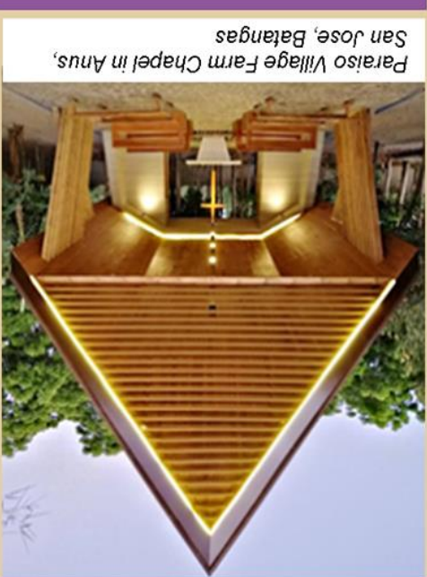
San Jose, Batangas Paraiso Village Farm Chapel in Anus.